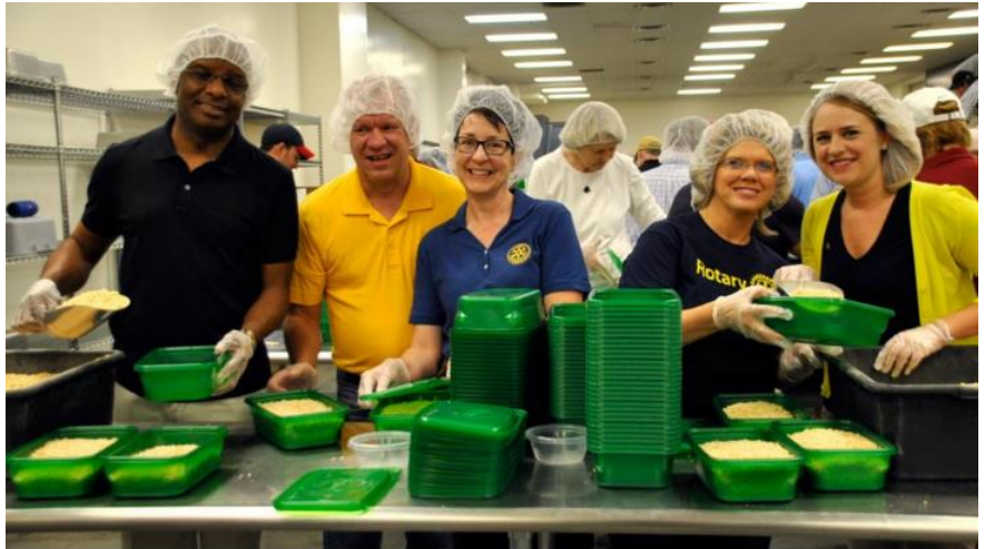
Rotary members from Columbia, Missouri, USA, volunteer at a regional food bank.

Local Rotaract members pitched in as well.