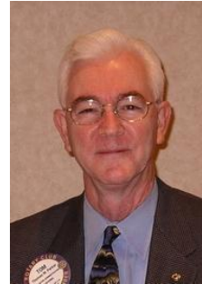
Community Service Director McKinney Sunrise Rotary