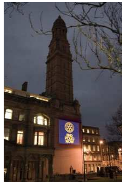
The Greenock Town Hall on the River Clyde in Scotland is illuminated with the End Polio Now logo last year on 23 February. Plans are underway to illuminate the Wrigley Building in Chicago and other landmarks this year.

RI provides many resources to help your club or district celebrate. Here are some suggestions: