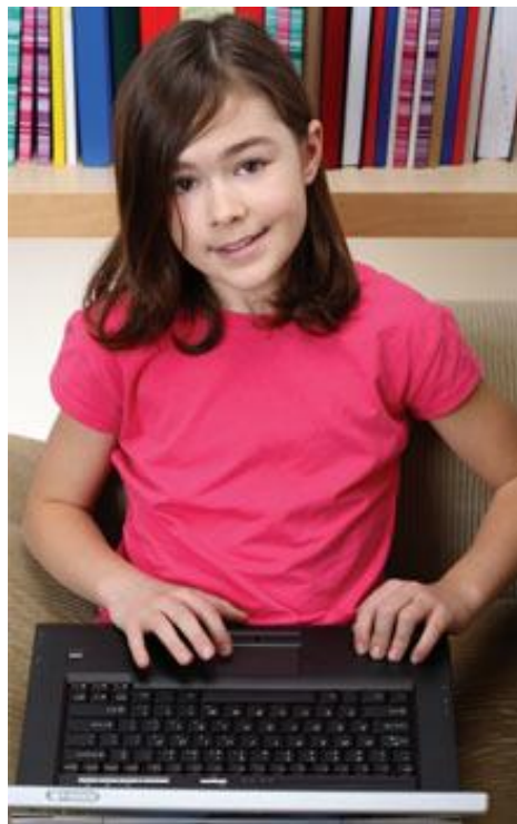
The tutoring program, which uses Skype, launched last March with a pilot involving six students and five Rotarian mentors.