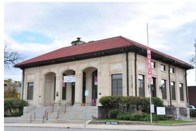
Collin County Museum