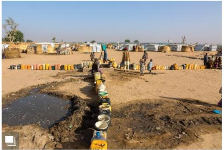
An estimated 15,000 people live in the Muna Garage camp, an informal settlement on private land.

The discovery triggered an increase in vaccinations in other countries that have similarly inaccessible areas. In Nigeria alone, more than 850,000 children were vaccinated in the first five days after the cases were discovered, according to the country's health minister. And