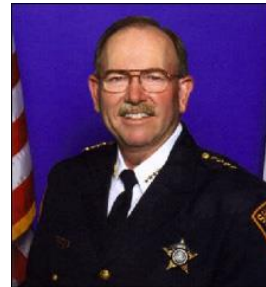
Sheriff, Collin County