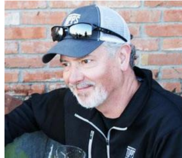
Founder, President of Tupps Brewery