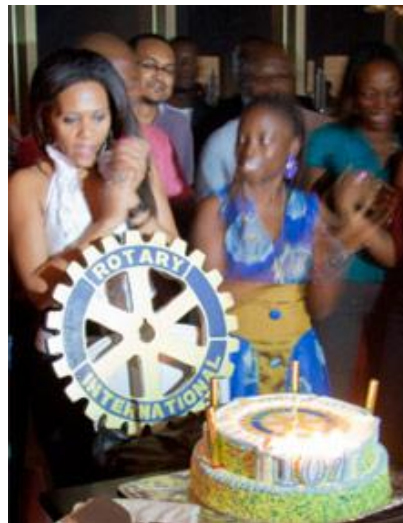
Top: The Rotary Club of Cotonou Ifê, Benin, celebrates Rotary's anniversary with a cake in February. The club is one of several formed recently in Benin.

Villaça-Crestia says her favorite thing to say to prospective members is that by being Rotarians, they can be a bridge between the millions of dollars available through The Rotary