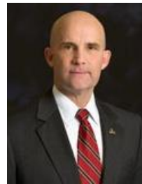
Keith Self Collin County Judge