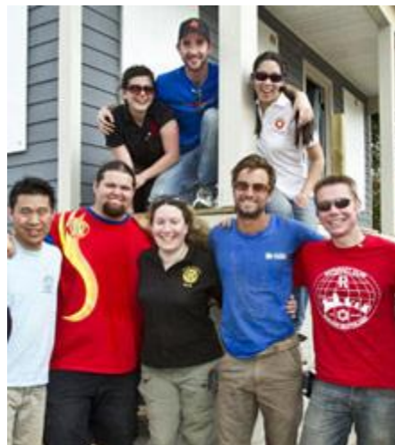
Regional membership plans offer recommendations for each region, based on its strengths and historical trends. One of the recommendations in several of the plans is to reach out to Rotary Foundation and program alumni.