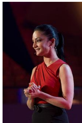
Actress Archie Panjabi explains why she agreed to be a Rotary polio eradication ambassador.