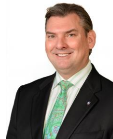
Governor, Rotary District 5810