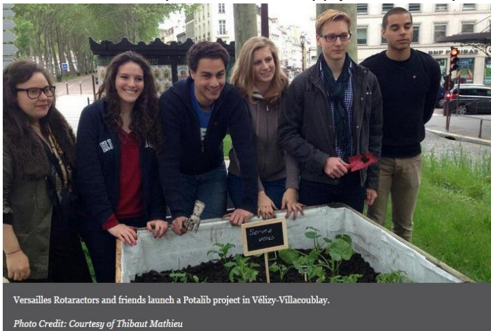
Versailles Rotaractors and friends launch a Potalib project in Vélizy-Villacoublay.

The club registered the Potalib name, created a brand, and now sells the project as a kit to French institutions, local communities, and corporations. The materials include seeds for as many as 18 kinds of vegetables, information on how to cultivate them, and 12 wooden bins, each about a cubic meter in size and filled with around 270 kilograms of soil. In cities where the gardens are planted, the club sponsors a festive opening-day ceremony, featuring a free meal cooked by club members and a professional chef.