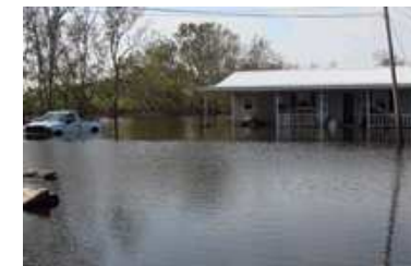
Hugh Summers (right) District 5910 disaster preparedness chairman, hands a check to Red Cross Chairman Bob Snow, of the Rotary Club of Palestine, Texas, to help cover the cost of sheltering 475 people after Hurricane Ike swept through Texas. Below: Flood waters surround a house near Houma, Louisiana.