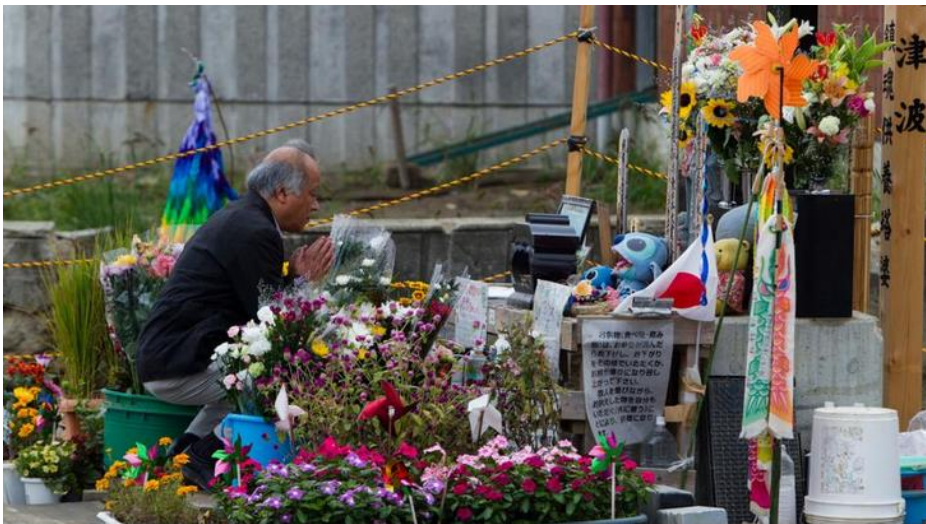
Mourner prays at the memorial for students and teachers of the Elementary School of Okawa in Ishinomaki, Miyagi Prefecture, Japan, 11 September 2011.