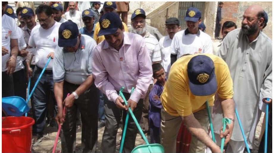
Rotarians, Rotary partners, and employees from Coca-Cola Beverages Pakistan join forces to conduct a cleanup campaign in Gadap Town, one of Karachi's high-risk areas for polio.