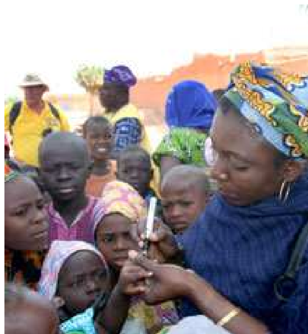
A health worker in Nigeria marks a girl's pinkie finger to indicate immunization against polio. Use of the bivalent oral polio vaccine has helped slash incidence of the disease there by 98 percent.