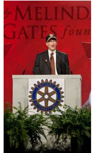
Bill Gates announces a new US$255 million grant for ending polio at the 2009 International Assembly in San Diego, California, USA.