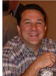
Co Vice President of Flags McKinney Sunrise Rotary