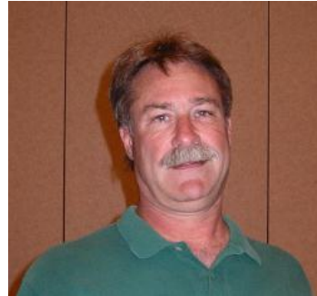
McKinney Sunrise Rotary