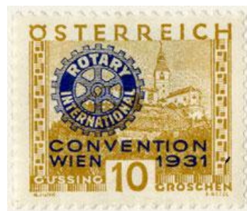
Top: The commemorative stamp designed for the Rotary Club of Essen. Bottom: A commemorative stamp in honor of the 1931 RI Convention in Vienna.