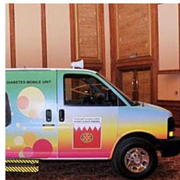
The Rotary Club of Manama, Bahrain, donated a mobile diabetes unit to help combat type 2 diabetes among the country's youth.

The van, which cost US$111,400 to equip, travels to schools and neighborhoods across the nation to screen children for diabetes and educate families on prevention. The unit's staff consists of volunteer doctors, nurses, and students from the Bahrain medical campus of the Royal College of Surgeons in Ireland.