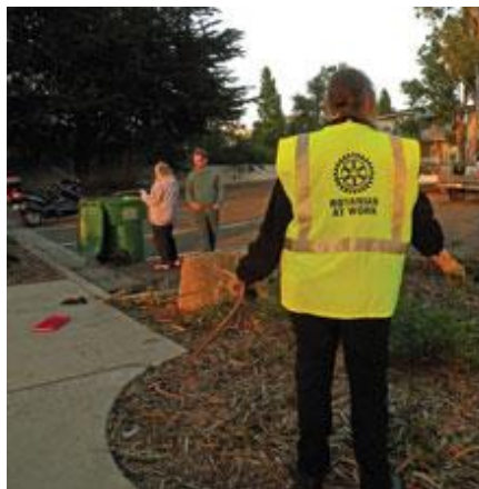
Rotarians do trail maintenance at the park.