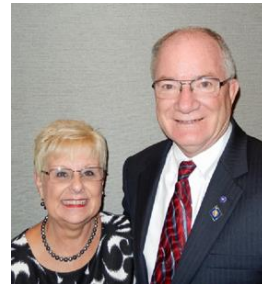
District Governor Rotary District 5810