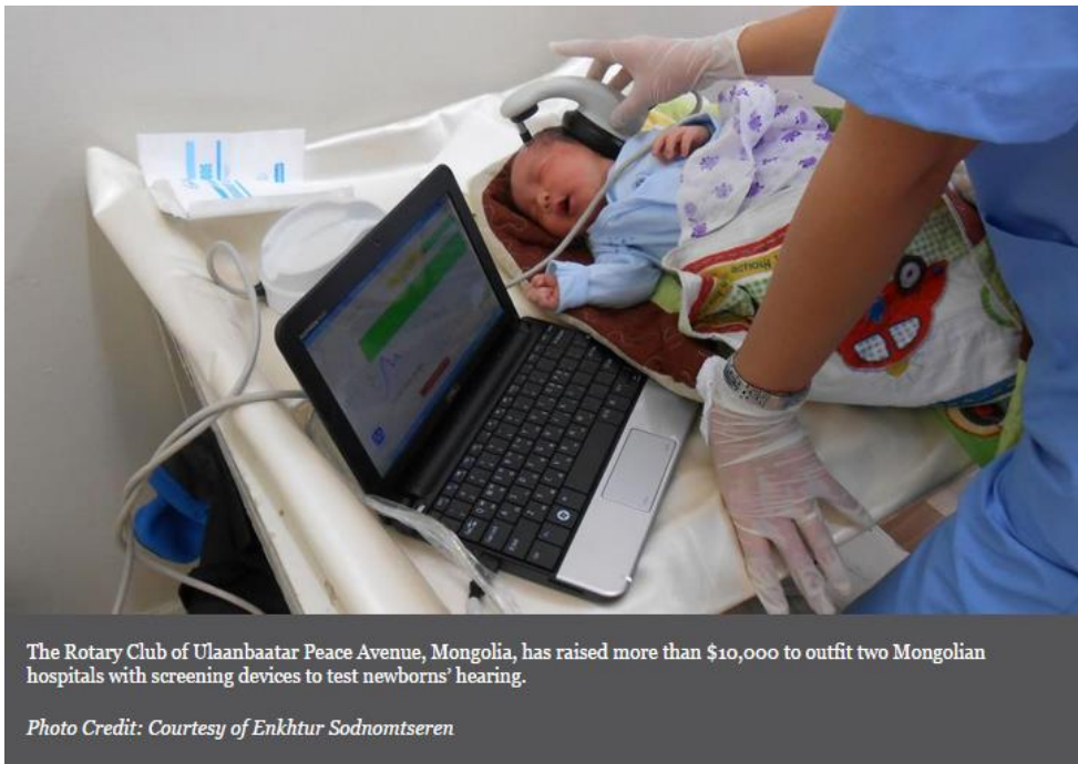
The Rotary Club of Ulaanbaatar Peace Avenue, Mongolia, has raised more than $10,000 to outfit two Mongolian hospitals with screening devices to test newborns' hearing.