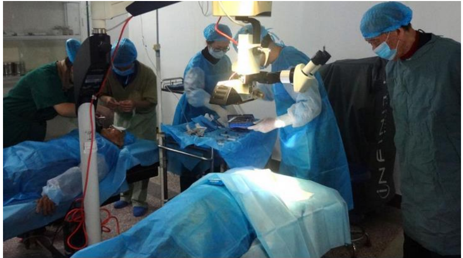
Four hundred citizens in northeast China received free cataract surgeries in 2013 thanks to efforts by the Rotary Clubs of Warner Robins, Georgia, USA, and Shanghai, China.