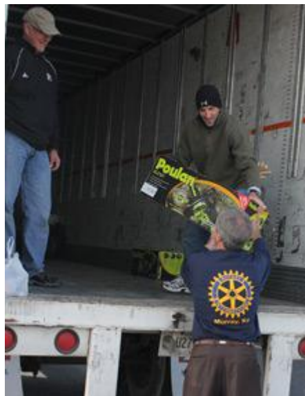
Top: Rotaractors at the Rotary-UN Day distributed 350 boxed lunches to the Bowery Mission in New York City on 3 November. Bottom: Members of the Rotary Club of Murray, Kentucky, USA, fill a truck with relief supplies.